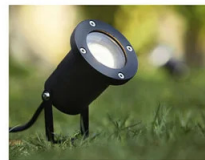
USE IN THE GARDEN