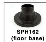
SPH162 (floor base)