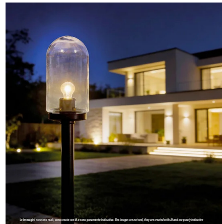
Le immagini non sono reali, sono create con IA e sono puramente indicative. The images are not real, they are created with AI and are purely indicative