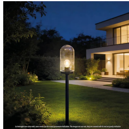
Le immagini non sono reali, sono create con IA e sono puramente indicative. The images are not real, they are created with AI and are purely indicative