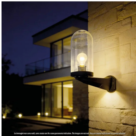
Le immagini non sono reali, sono create con IA e sono puramente indicative. The images are not real, they are created with AI and are purely indicative