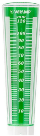
Scala graduata precisa da 0 a 120mm Precise scale mark from 0 to 120mm